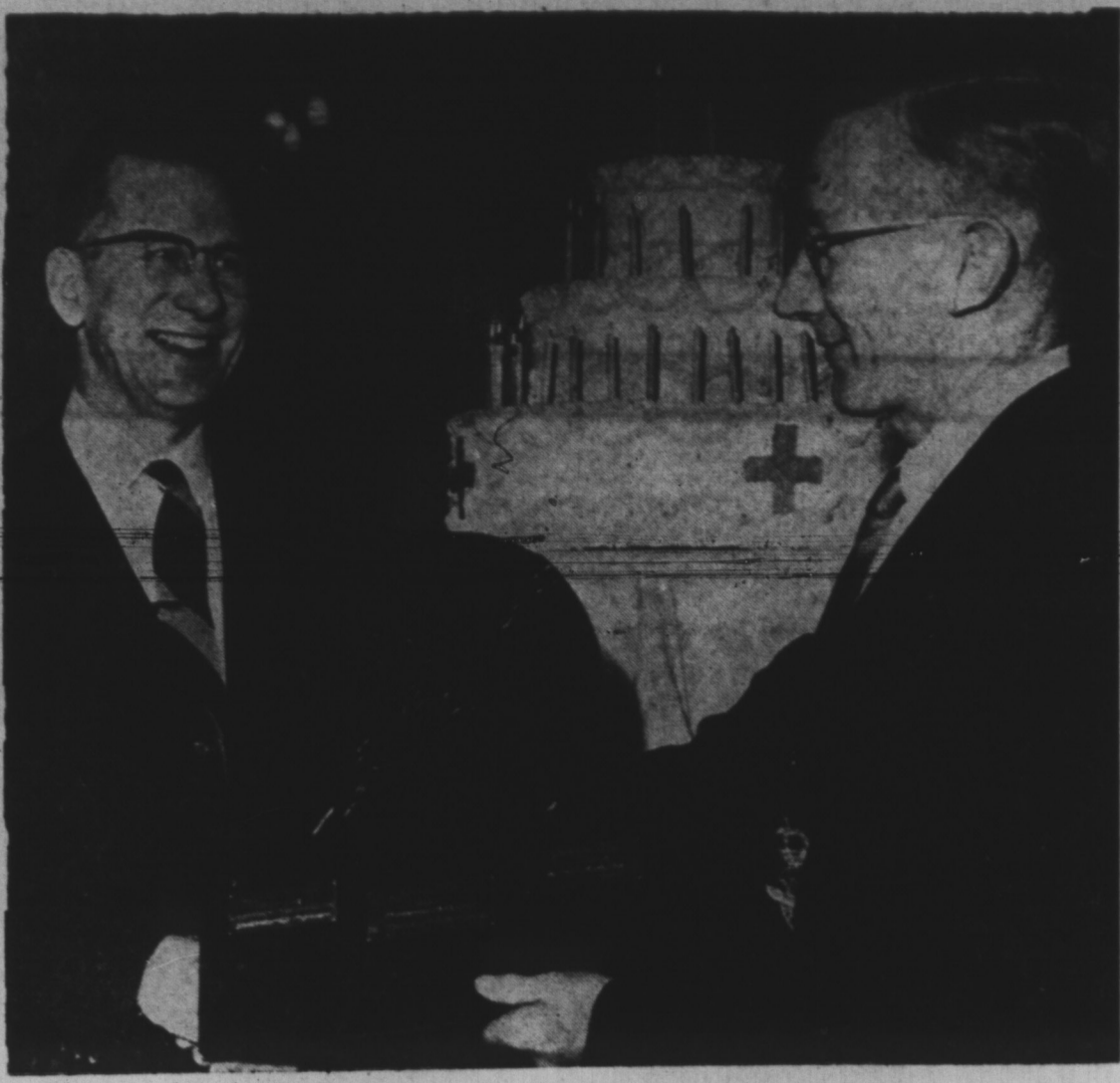
PRESENTS TROPHY TO KINKORA