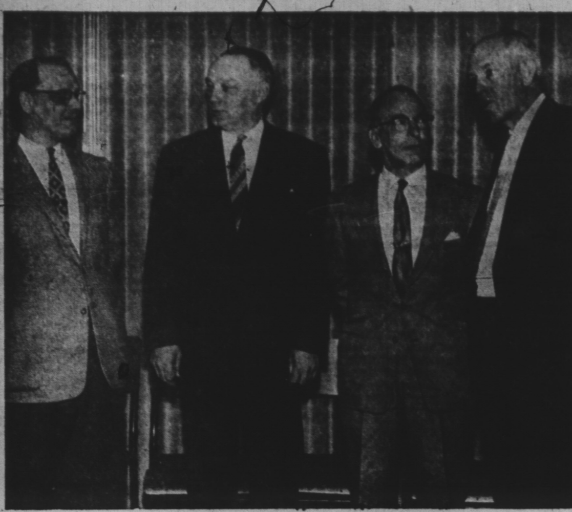
ATTEND C.N.T. CONFERENCE

Two managers of Canadian National Telegraphs offices in Prince Edward Island were among approximately 50 delegates who attended a two-day conference on communications which opened in Moncton Thursday.