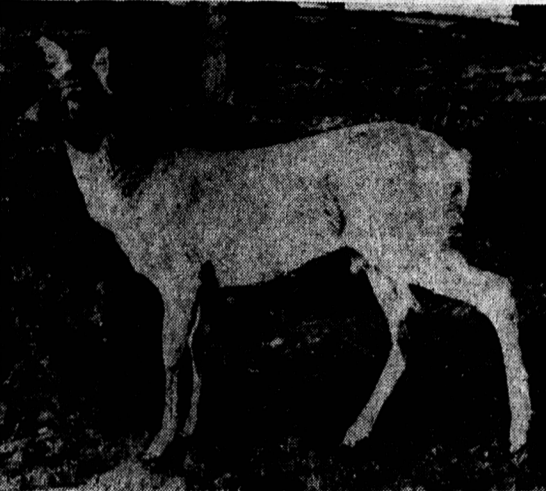
The tameness of the young deer brought into this Province within the past couple of years is well illustrated by this animal which wandered out on the main highway at St. Peter's Lake. It walked up to one bystander and permitted itself to be patted while it licked the hand of another spectator.

Charlottetown market. In any event, importers had to get rid of these expensive potatoes, and while doing so we are not particularly keen to buy or deal in old stock.