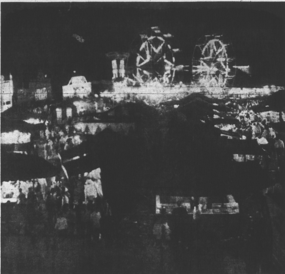
LYNCH'S MIDWAY AT OLD HOME WEEK