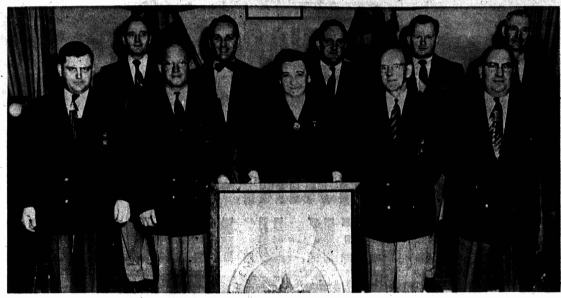
At Annual Banquet Of Local Legion Branch