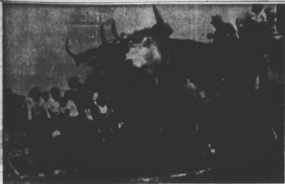
CHAMPIONS AT LUNENBURG