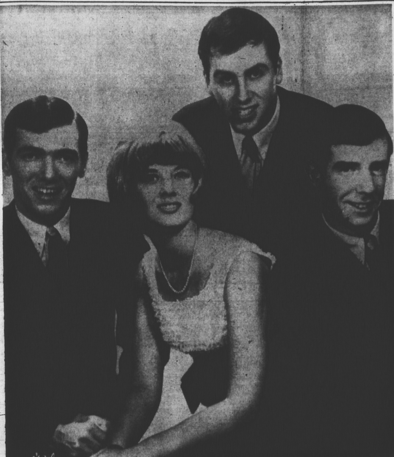
THESE ARE THE Villagers, the internationally famed quartet of folk singers who arrive Tuesday to take part in the Prince of Wales College Winter Carnival. The group will perform Wednesday night at the Basilica Recreation Centre in Charlottetown. The Villagers have acquired a reputation internationally as one of the more important entertainment units.

GUARDIAN-PATRIOT CENTRAL PRINTERY PHONE 4-8506