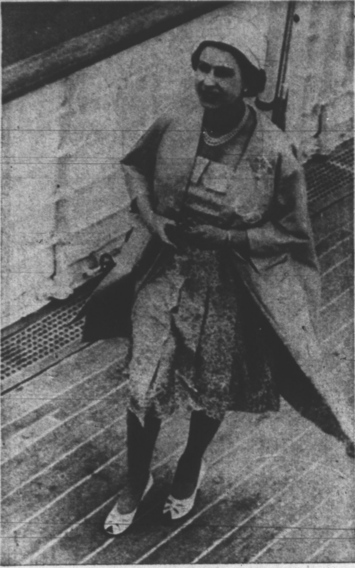
IN GAY MOOD ABOARD BRITANNIA

Probably nowhere in the Commonwealth is there a greater attachment for the Crown than in Canada's smallest province—Prince Edward Island. Divided into three counties, these are known as Prince, Queens and Kings, providing a distinct Royal flavor.