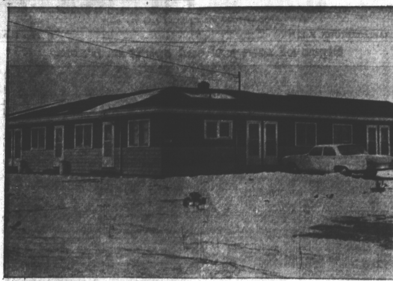
GREEN ACRES MOTEL WILL IMPROVE TOURIST FACILITIES AT ST. ELEANORS