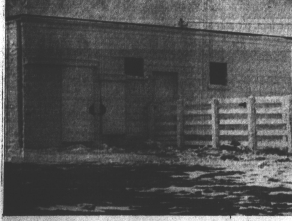
ERECTION OF ABATOIR WAS AN OTHER ST. ELEANORS ACHIEVEMENT.