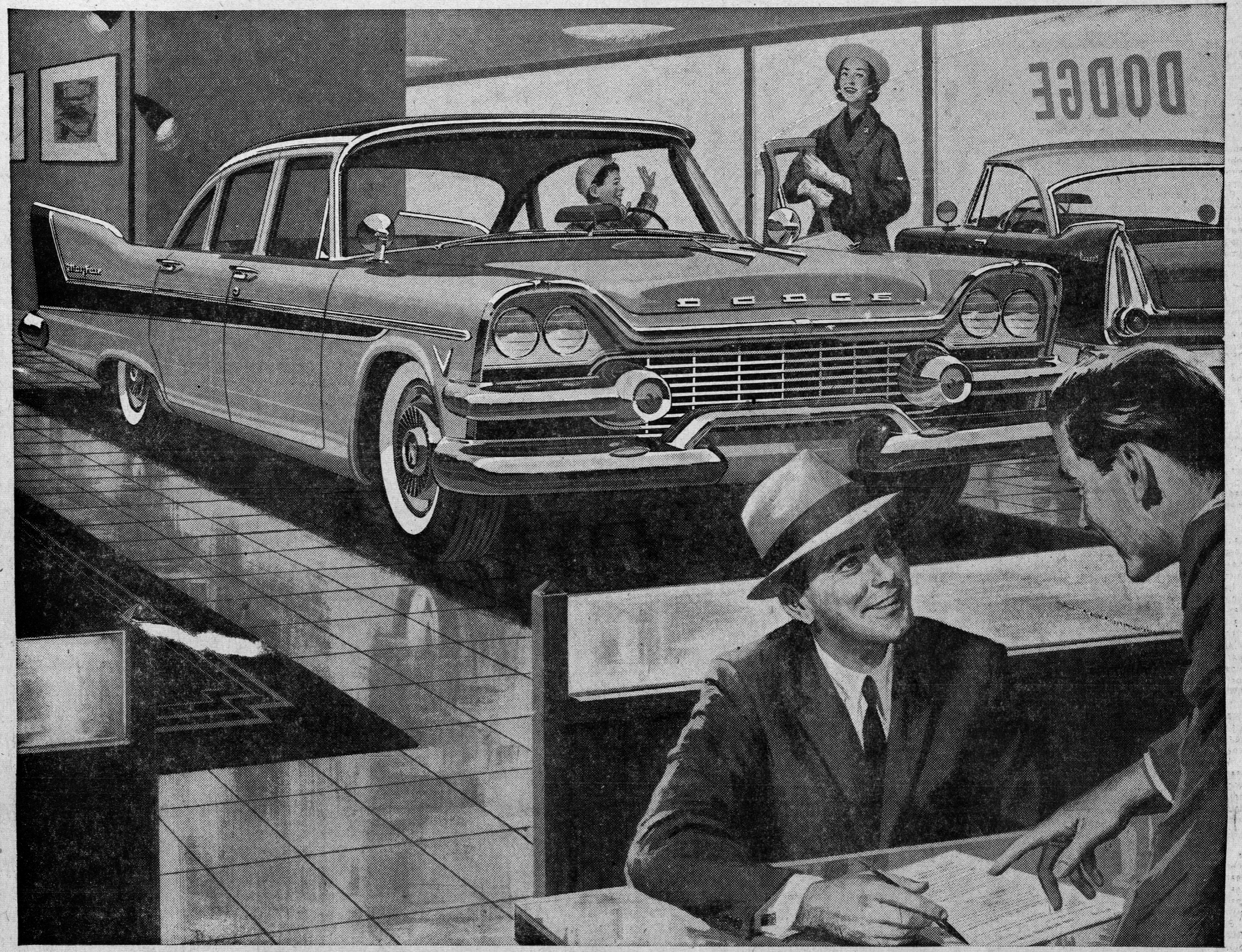
You're looking at another delighted Dodge family... this one beaming over their stunning new Mayfair 4-door sedan

BIG, BOLD, BEAUTIFUL...and low-priced, too!