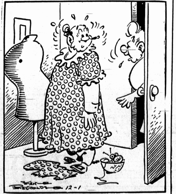
"Now that my dress is finished—where's the camera we got with a Guardian Want Ad?"