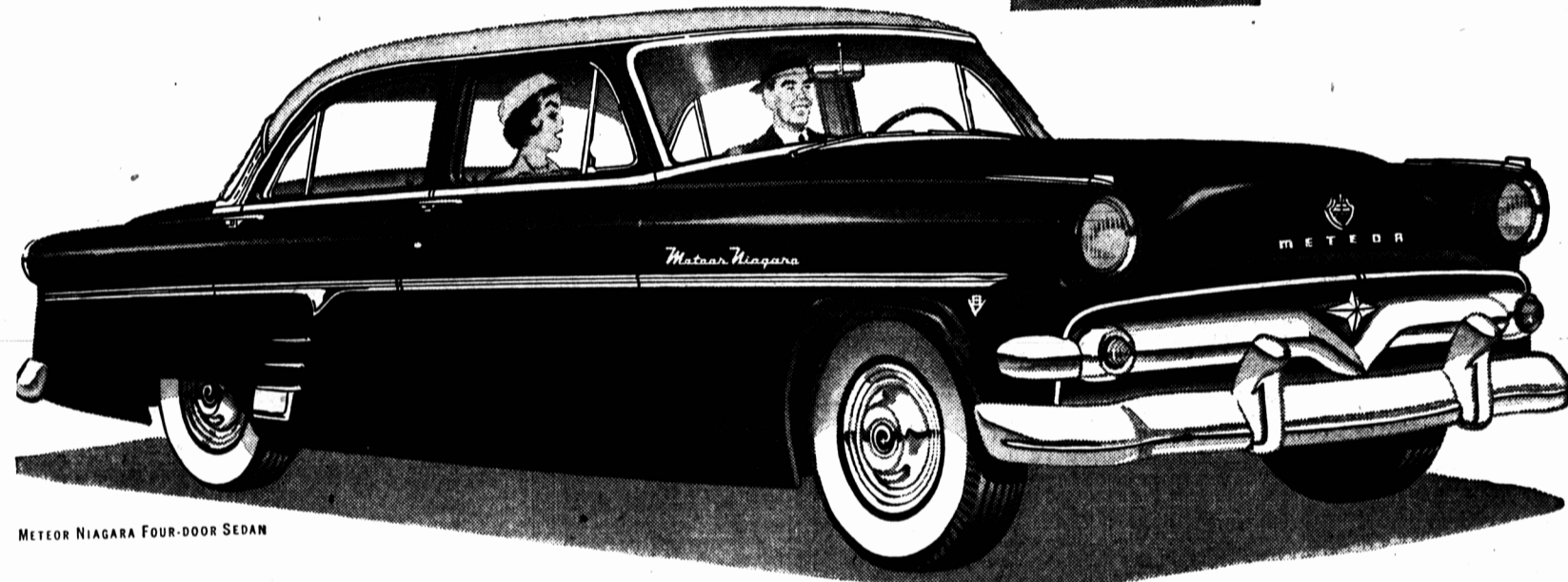
METEOR NIAGARA FOUR-DOOR SEDAN

Powered ahead to match the styled-ahead beauty of Meteor Rideau and Meteor Niagara models