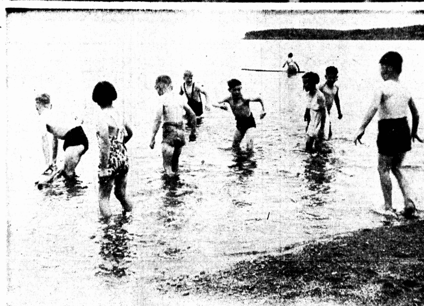
OUCH THIS WATER'S COLD! Some of the braver members of Mount Herbert Orphanage prepare for a dip at the Keppoch beach picnic given for them by the Lucy Maud Montgomery Chapter of the