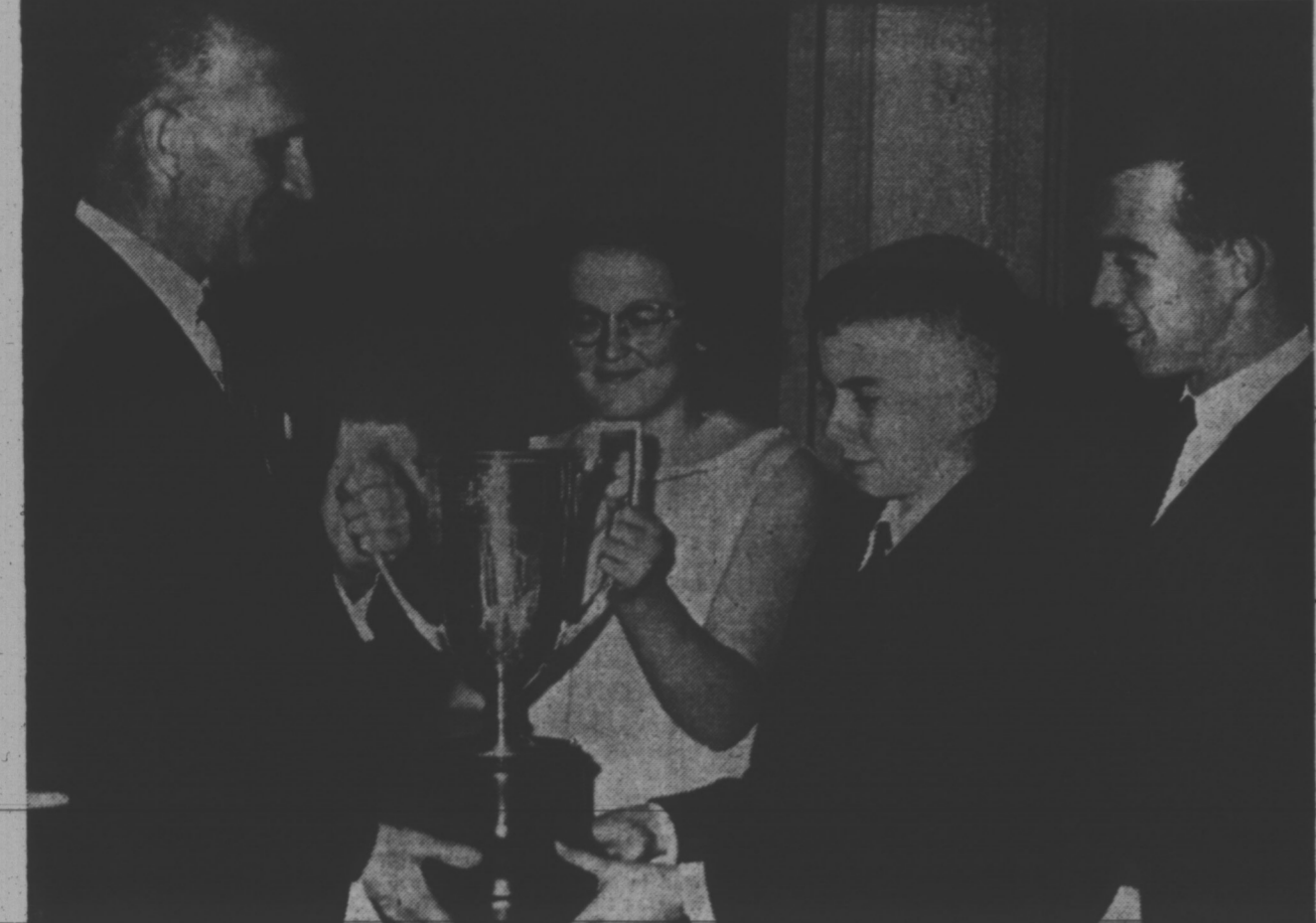
SEVERAL HUNDRED 4-H Club leaders and a few club members attended a dinner held last night at the Charlottetown Hotel...