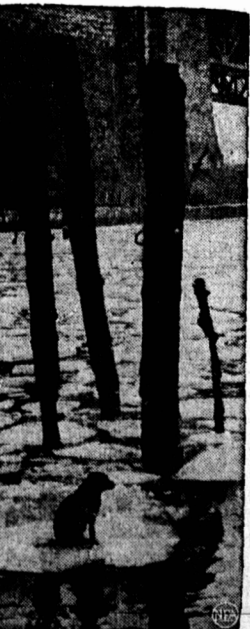
ICE-COLD TALE PROVES MAN IS A DOGGIE'S BEST FRIEND — Drifting on an ice floe in the Delaware River at Philadelphia,