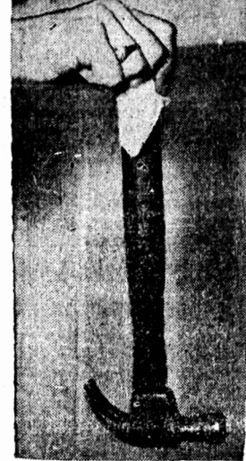
BLOOD-STAINED HAMMER Found in the Hay