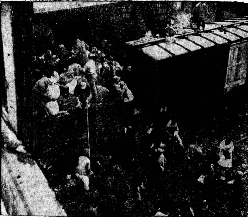
REFUGEE FREIGHT — Fleeing aboard freight cars about to leave Seoul, South Koreans clamber the city. All civilians and non-combatant military personnel were ordered out of the city.