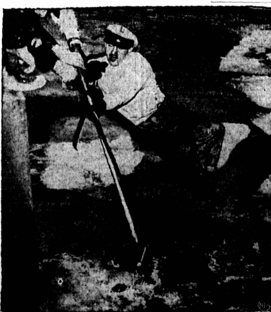
this little pup was a picture of dejection. Nobody knew how he got there, but city police and firemen pooled their talents to haul in the wretched pooch, providing the action picture of the rescue at right.