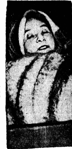
Smiling from her stretcher, 81-year-old Princess Marie of Greece arrives in Boston by plane for treatment of a fractured hip. She suffered the injury when she fell in her garden in Athens, Dec. 19. Her husband, Prince George, came with her.