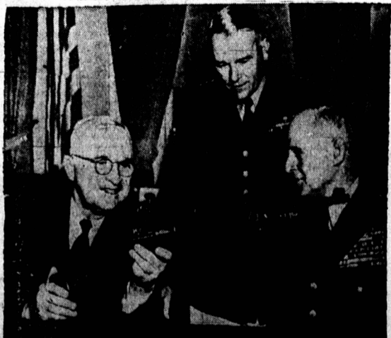
U.S. forces in Europe through their retiring commander, Gen. Clarence R. Huebner (right), present a carbine to President Truman in the presence of Army Chief of Staff Gen. J. Lawton Collins. The weapon's inscription at this White House ceremony reads: "To our Commander-in-Chief Harry S. Truman from U.S. Forces in Europe."