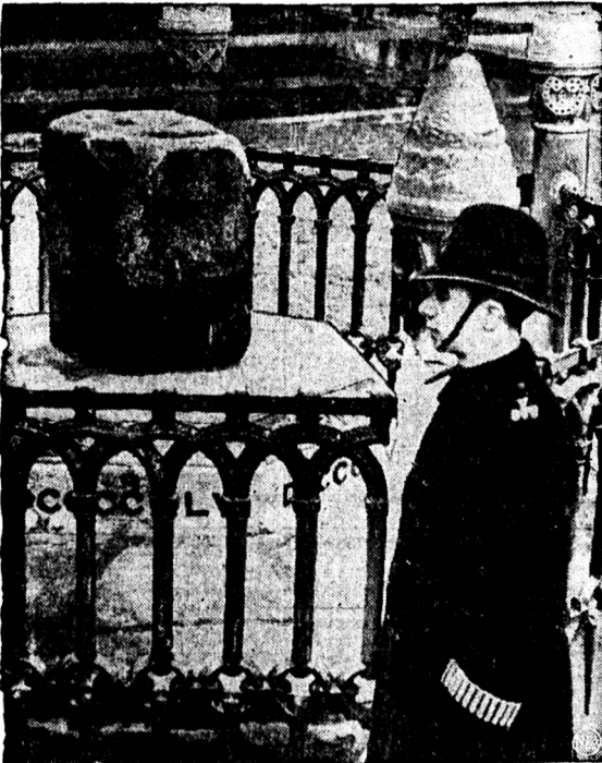
WATCH ON THE ROCK — A policeman guards the ancient Saxon Coronation Stone near the Guildhall at Kingston-on-Thames, Surrey, England. A special guard was posted at this historic stone, a relic of the coronation of Saxon kings, after the recent theft of the famous Stone of Scone from London's Westminster Abbey.