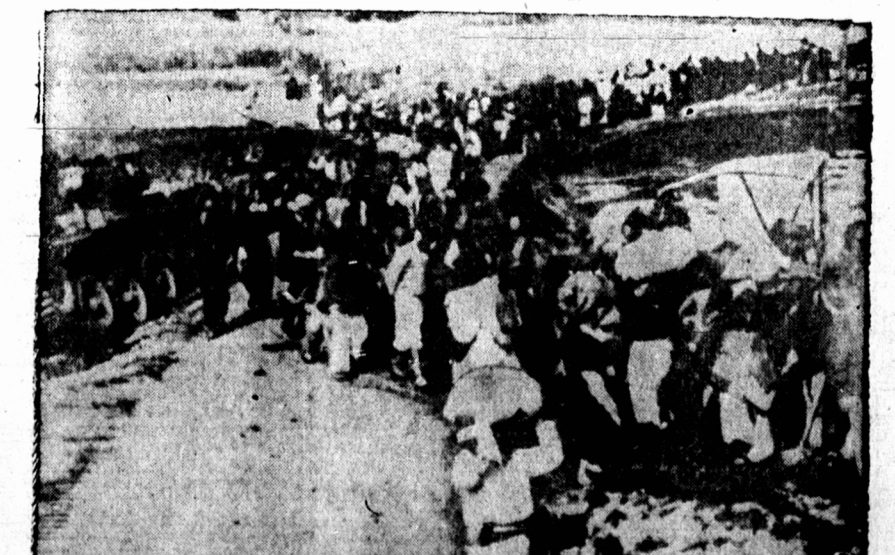
HUMAN TRAFFIC JAM — As Communist forces neared Seoul, refugees heading south clog roads. The tank (left) was bogged down by the heavy human traffic. Refugees on southbound highways hindered UN military operations.