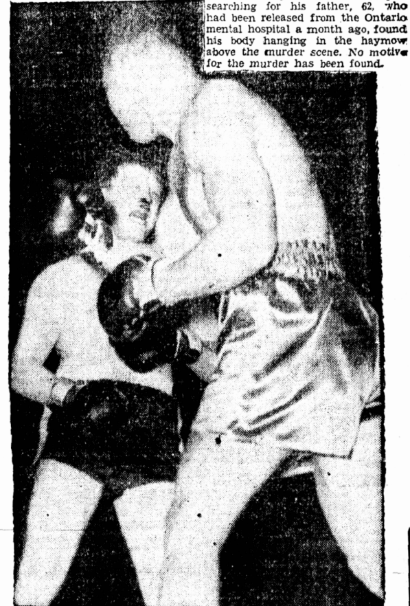
Freddie Beshore is bleeding from the nose and mouth as he stands dazed after being hammered by Joe Louis. Photo was taken in the fourth round of their heavyweight fight at Detroit January 3. A few seconds later, the fight was stopped by referee and Louis was awarded the official victory by TKO.