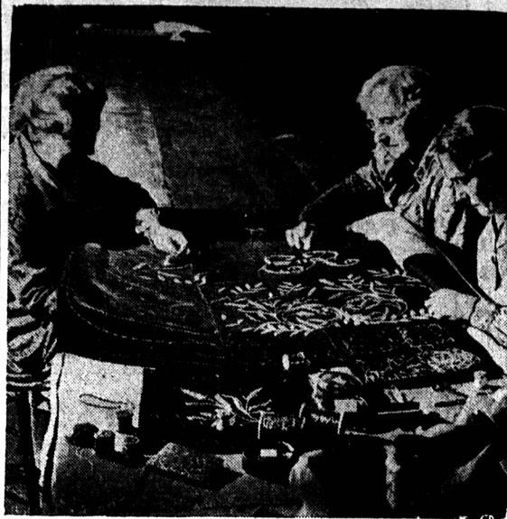
The royal purple robe to be worn by Queen Elizabeth at her Coronation now is being embroidered by skilled women at the Royal School of Needlework in Prince's Gate, Kensington. The robe, of pure silk, and 18 feet long is being embroidered in a design chosen by the Queen.