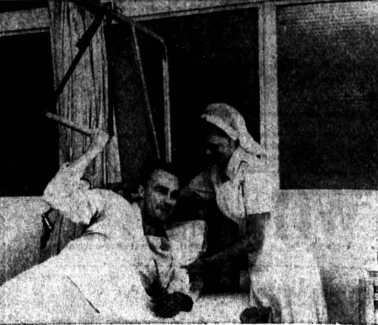
D. V. A. opening School in Halifax 15 April, 1953.

Canada needs Nursing Assistants for peace time service and national emergencies, to help in the care of patients in hospitals and homes.