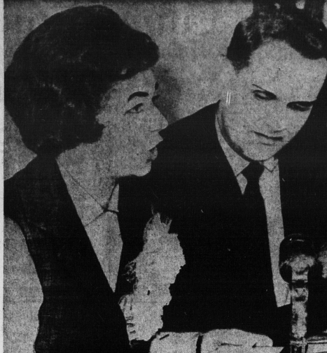
SISTER SAYS FIDEL'S DAYS NUMBERED