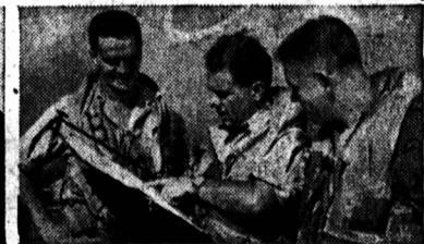
PRE-FLIGHT CONFERENCE —The Pilot-Observer teams of the RCN check details before a flight. Teamwork is a keyword in the Navy.