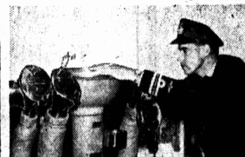
OFFICER OF THE WATCH —On the bridge, the Naval Aviator is thoroughly trained in seamanship as well as airmanship. This Naval Pilot takes a bearings.