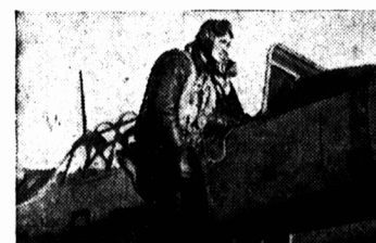
FLYING TRAINING —The Navy's Aviators get complete flying training at land bases before they spread their wings at sea.