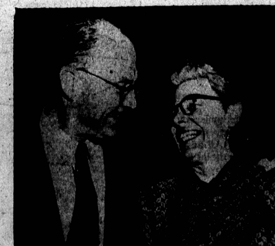
U.S. Far East expert Owen Lattimore grins happily and embraces his wife after Senator Tydings of Maryland told him that the "F.E.L. files put you in the clear up to this minute." The chairman of the Senate group probing Communist infiltration of the State Department made his observation at the conclusion of Lattimore's day-long and spirited denial of charges by Republican Senator Joseph McCarthy that Lattimore is "top Soviet espionage agent in the U.S."