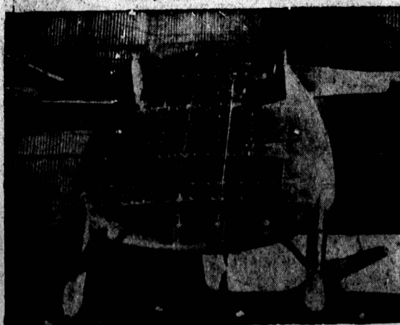
ANOTHER "SAUCER", ANOTHER DENIAL — A weekly news magazine published this picture of a pancake-shaped aircraft model as evidence that "flying saucers" are real aircraft, probably being developed by the Navy. The Navy denied doing any research work with any type of plane or guided missile that resembles a flying saucer. This model is reputed for tests in the NACA laboratory at Langley, Va. A 3,000-pound scale model was flown under radio control in 1948. The full-scale prototype, called the XF8U-1, was never flown, a Defense Department spokesman said.