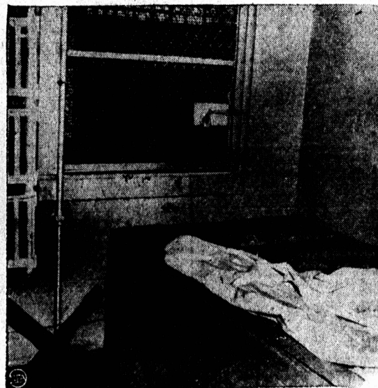
Chained for the night to concrete slabs in cells like this, five mental patients died when fire broke out in the Bella Vista Sanitarium, Philadelphia. Four others perished in the blaze, and 30 more were overcome by smoke. Firemen, trying to reach patients, were confronted with mesh-protected windows.