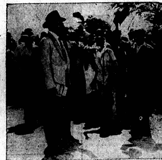
Seretse Khama, chief-designate of the African Bamangwato tribe, is seen being cheered by tribesmen as he took a stroll, after his arrival, his wife after Senator Tydings of Maryland told him that the "F.E.L. files put you in the clear up to this minute." The chairman of the Senate group probing Communist infiltration of the State Department made his observation at the conclusion of Lattimore's day-long and spirited denial of charges by Republican Senator Joseph McCarthy that Lattimore is "top Soviet espionage agent in the U.S."