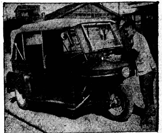
JAP AUTO FEATURES "THREE-WHEELING" — Making its first appearance in Tokyo is this "Glant" auto, built on a motorcycle chassis, but capable of carrying five passengers. The "convertible sedan" sells for the U.S. equivalent of $780.