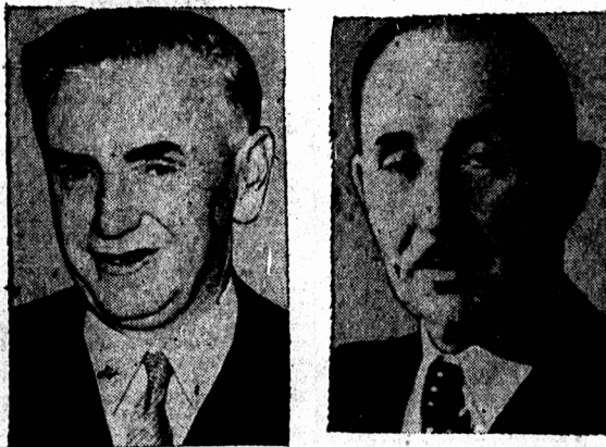
Premier John A. Costello, left, of the Independent Irish Republic in Southern Ireland hailed the adoption of the Fogarty amendment by the U.S. Congress as "very heartening." Congress voted to cut off Marshall aid unless Britain ends the partition of Ireland. Northern Irishmen waxed indignant, Southern Irishmen cheered at the news. Sir Basil Brooks, right, Northern Ireland Premier, refused to comment directly on the vote, but told newsmen in London: "I stand by my earlier declaration that we in Northern Ireland intend to remain within the United Kingdom and the British Commonwealth, giving our whole-hearted allegiance to the Crown."