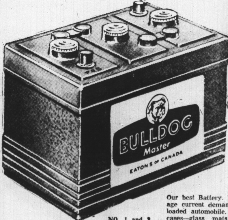
NO. 1 and 2

Equivalent in quality to batteries installed on new cars. Features include hard rubber cases, resin-bonded separators plus silver cobalt additive.