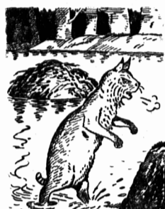
He turned and waded ashore.

"It is down under water. That is where it is," thought Old Man Coyote. "There must be a tunnel in the bottom of the pond out to where the water is deepest. When she dived she must have gone down to that tunnel, and gone in that way."