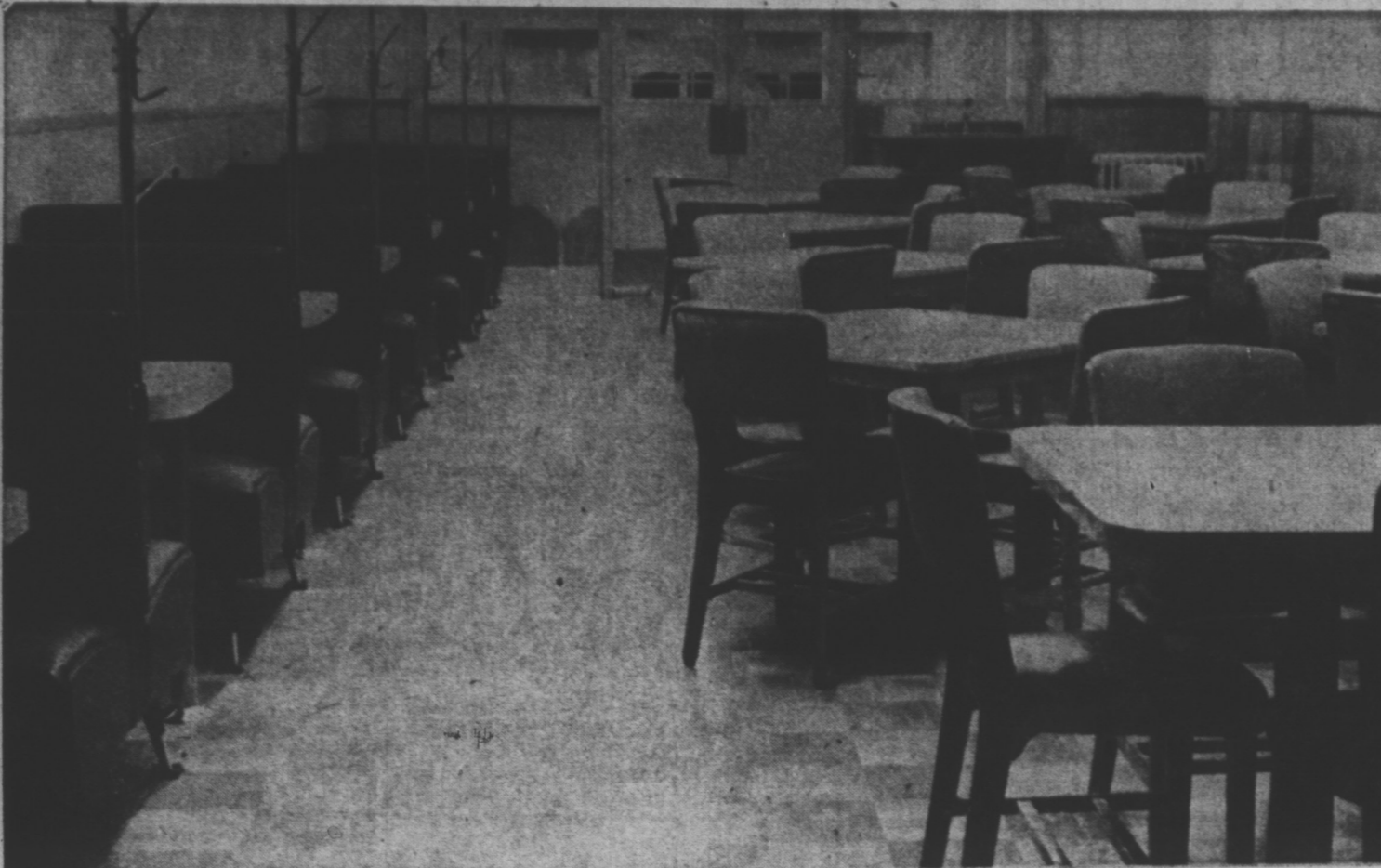
RENOVATION HAS HEIGHTENED ATTRACTIVENESS, COMFORT OF DINING AREA