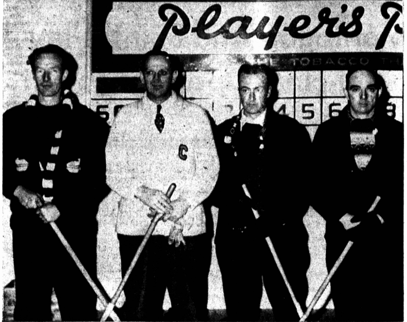
The Winner And Runner-up