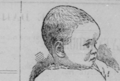
BABY RITTED, Infant, etc.

To do this effectively each passenger must be assigned to one seat. If trains were so made up, with light weight cars, with comfortable and airy seats, and with doors on the sides so that the cars could be coupled up close together, and parlor and smoking cars displaced, the weight would be lessened and the vast importance of lessening it, writes W. Barnett Le Van in The Engineering Magazine.