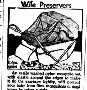
An easily washed nylon mosquito net with elastic around the edges to make it fit the carriage tightly, will protect your baby from flies, mosquitoes or dust when he takes a ride.