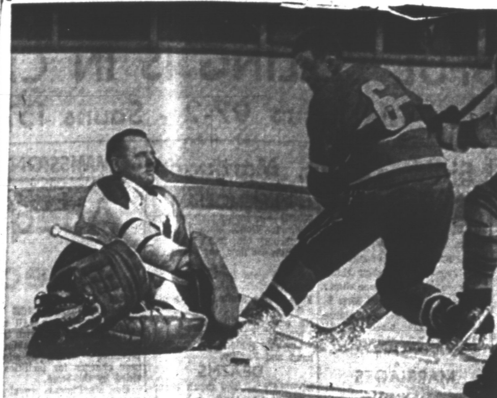
BOWER HURT Johnny Bower, goalie for Toronto Maple Leafs, winches with pain as the stick of Ralph Backstrom, Montreal Canadiens' centre, clips him across the side of the head during a National Hockey League game in the Montreal Forum. Bower got six stitches in the cut before continuing the game. Montreal won 5-2.