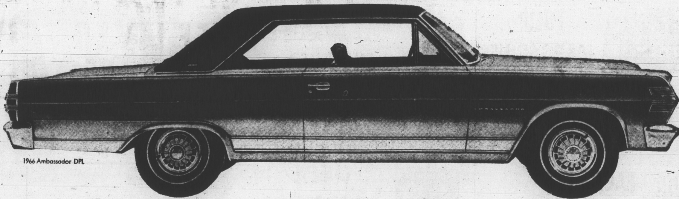
1966 Ambassador DPL