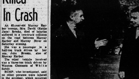
Woman Killed In Crash