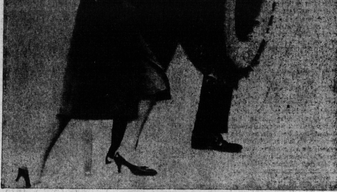
QUEEN ELIZABETH and Prince Philip are seen as they brought a wreath to place on the National War Memorial in Ottawa Monday. The ceremony was the first of their public activities in the capital.