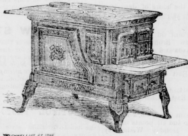
WELLSLEY ST. 1876