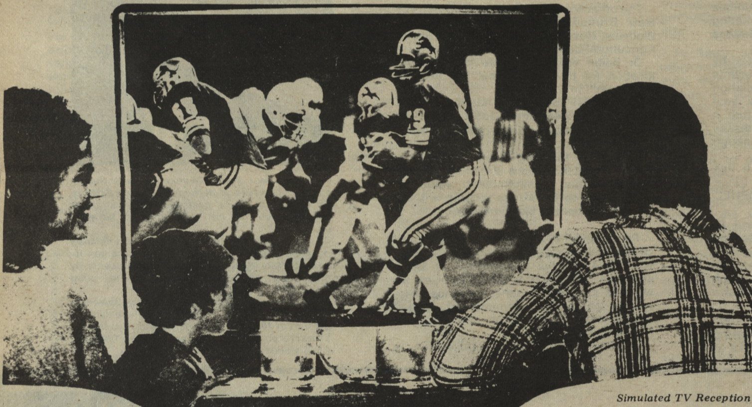
Simulated TV Reception

Sporting Events Are An Experience As Exciting As Being There! Movies Are Seen The Way They Were Meant To Be Seen! Pong And Other Video Games Are More Exciting Than Ever! Can Be Used With Video Tape Playback Equipment!