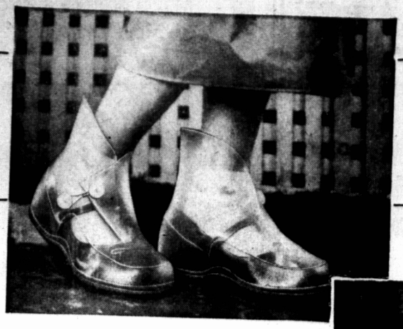
Misses' Puddlers . . . . 1.89