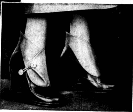
Women's Avenue Puddlers . . 1.98

Smartly styled plastic overshoes -- up to the minute in fashion, these long wearing weather-proof shoes fold compactly for easy carrying. On display now. --- Shoe Department Both Stores.