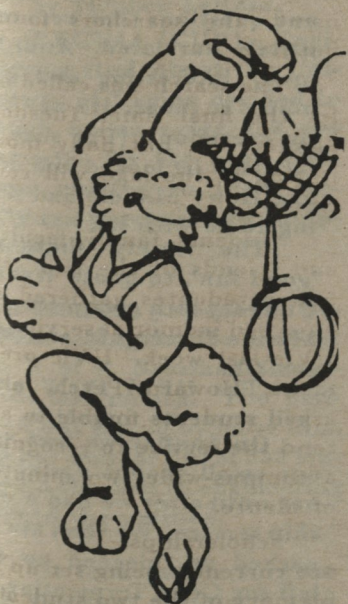
Graphic/ The Sheaf