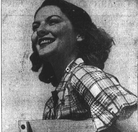
Use a portrait attachment to take informal portrait close-ups such as this with a box camera or fixed-focus folding model.

SUMMER is an ideal season for informal outdoor portraits of your family and friends, and informal portraits are about as easy to take as any other type of snapshot. Naturally, such informal shots are not to be compared with the work of skilled, experienced professional photographers. . . but, since you take them yourself for your own album, they do have unique personal interest.