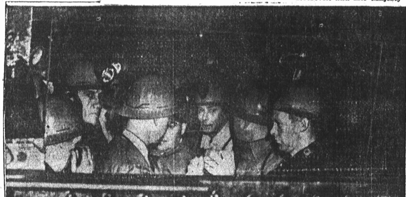
The King (third from right) wearing a miner's safety helmet and uniform, descends with officials and members of the Royal party into the Froot mine, a visit arranged at his request, during Their Majesties' stay in Sudbury. The Queen was also in the hoist cage, though not in picture.