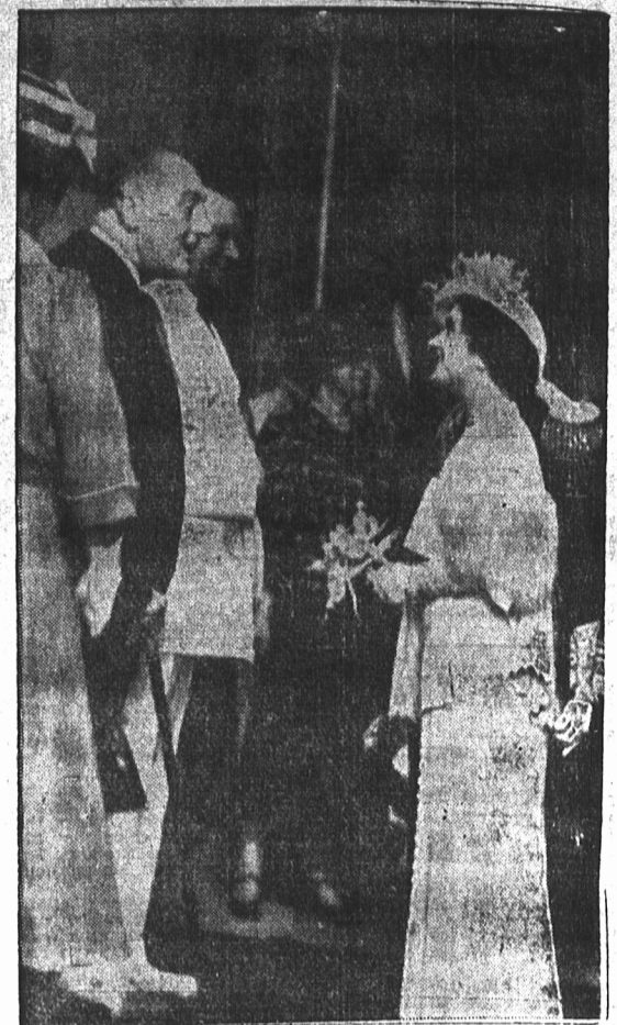
As President Roosevelt met the Queen in the presidential room at the Union Station, Washington. Left to right, Mrs. Roosevelt, the President, Brigadier-General Watson, Mrs. Hull, the Queen, and King standing behind.