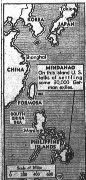
Above map shows Mindanao, second largest of Philippines, where U. S. may start colony for German refugees. Rich in iron, coal, chromium, and timber, Mindanao is now dominated by 20,000 Japanese settlers, who own half of arable land in Davao section, shown in black.