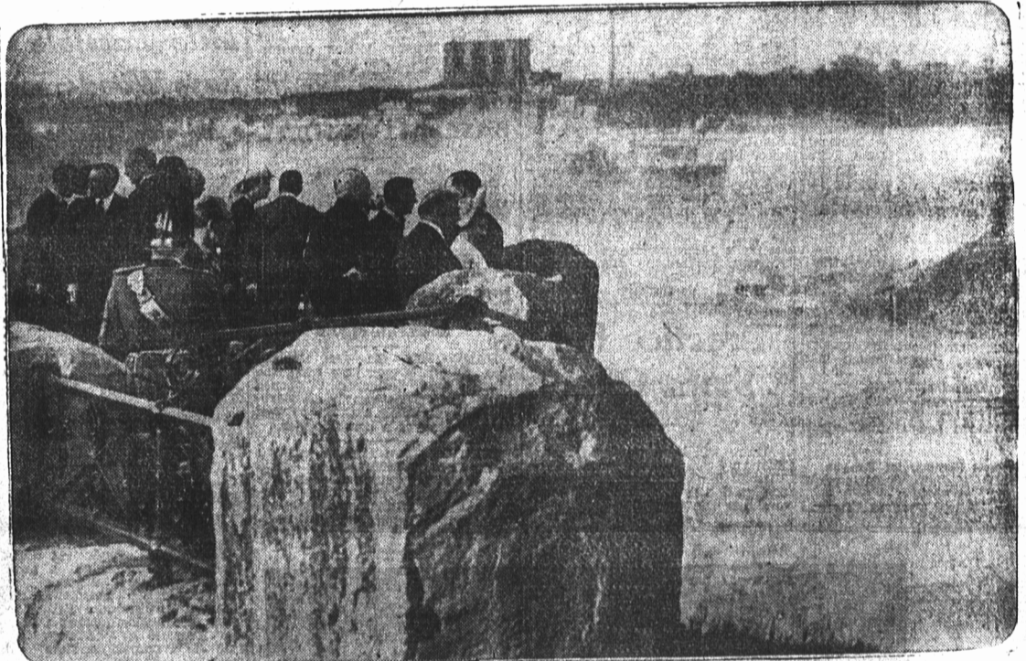
Here, shortly before their historic crossing into the United States, the King and Queen and their party gaze in wonder at mighty Niagara Falls. Through the curtain of flying spray tossed up by the plunging torrent, the American fall can be seen. The Royal party are standing on the point of the promenade nearest the Horseshoe Falls, outside the field of the camera to the right. The Queen stands at the right, Premier beside her, and the King on the Premier's left.