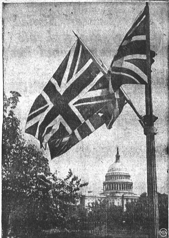
Washington, all dressed up for the visit of King George and Queen Elizabeth, presented this unusual view of the Capitol dome, framed by British Union Jacks.