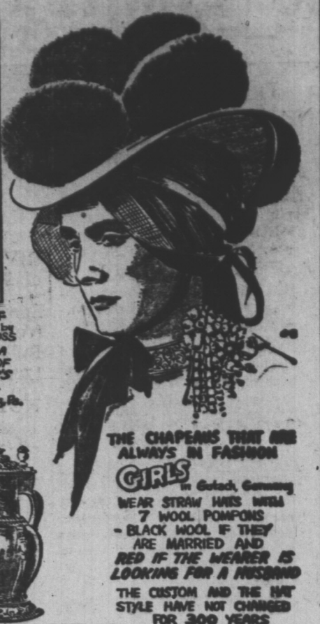
THE CHAMPERS THAT ARE ALWAYS IN FASHION WEAR STRAW HATS WITH 7 WOOL POMPONS - BLACK WOOL IF THEY ARE MARRIED AND RED IF THE MEMBER IS LOOKING FOR A HUSBAND - THE CUSTOM AND THE HAT STYLE HAVE NOT CHANGED FOR 300 YEARS