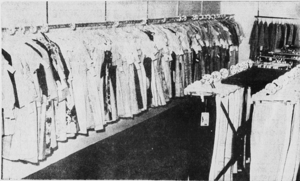
Pictured to the left is an interior view of our fine new Ladies' Wear Store.

One of Charlottetown's Newest and Most Modern Ladies' Wear Store !