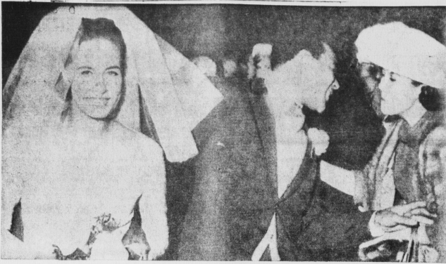
A KISS FOR THE BRIDEGROOM

Chubby Checker, Negro rock 'n' roll singer, leans over to kiss a spectator as he leads his bride, the former Cather