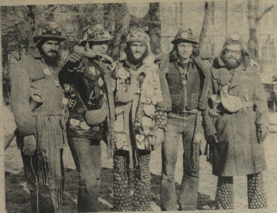
A group of carnival goers-- Note the button covered costumes