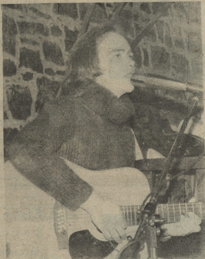
Lots of Entertainment