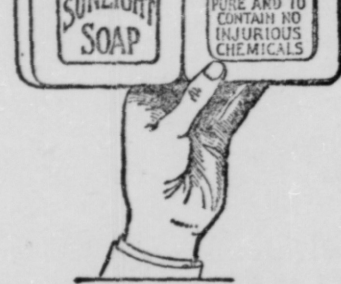
Awarded 11 Gold Medals

SUNLIGHT SOAP has been in use in Windsor Castle for the past 3 years, and its manufacturers have been specially appointed