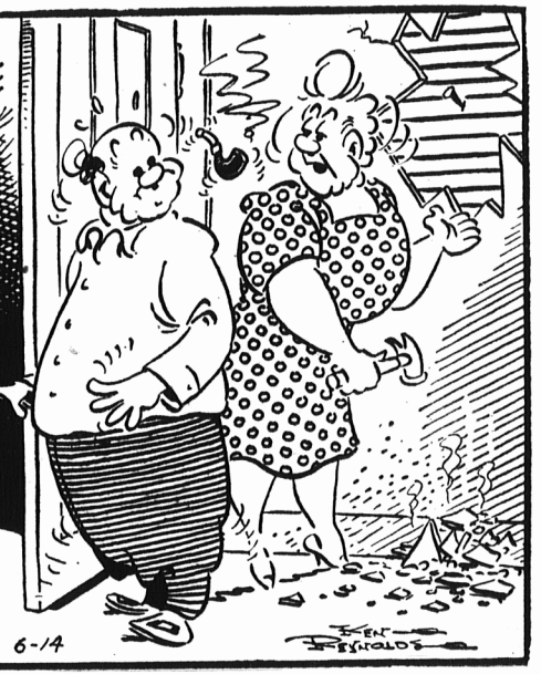
"Something's wrong with this hammer you got in the Guardian Want Ads—it misses that nail a mile!"

HELSINKI —(CP)— The most complex timepiece to be used at the Olympic Games here this summer is a new device including a quartz clock and speed camera, which took British and Swedish engineers five years to develop. The camera taking simultaneous pictures of runners at the finish line and official times is accurate within 1-100th of a second.