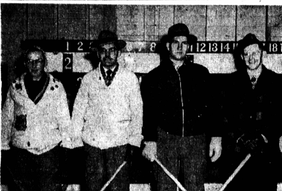
The Regal Trophy winners are pictured above following their sweep of curling honors at the Charlottetown Curling Club on Wednesday. The rink from Summerside defeated rinks from Charlottetown, Souris, Alberton and Montague to win the coveted trophy.