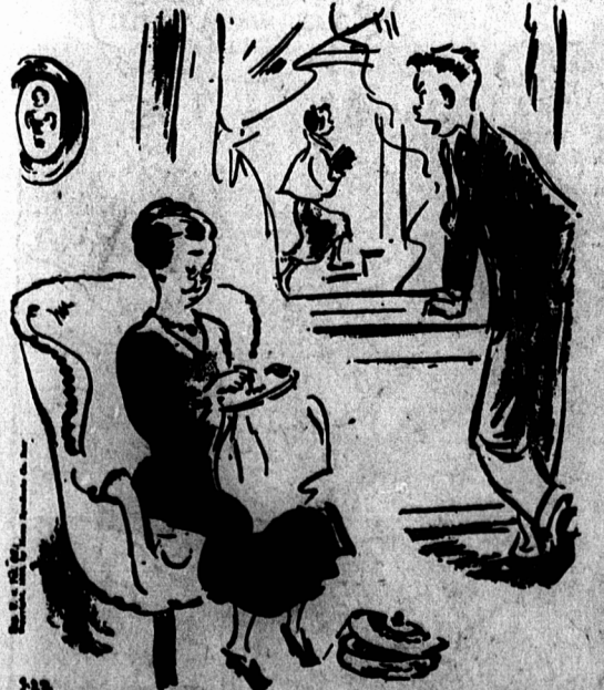
Trouble is, Mom, I live next door. She would be impressed if I could go somewhere and call her on long distance.