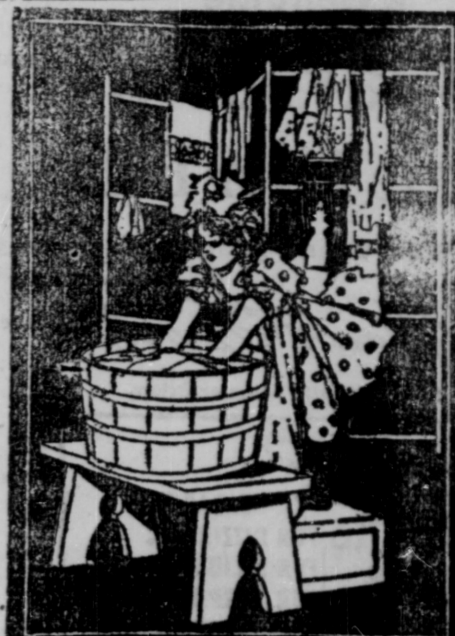
Makes Child's Play of Wash Day