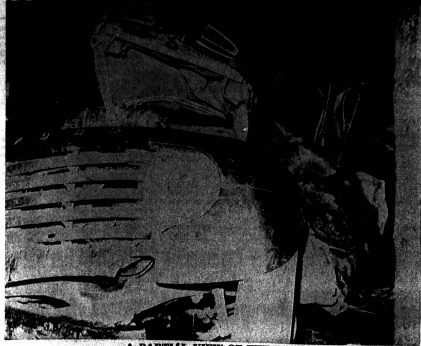
A PARTIAL VIEW OF THE TRUCK