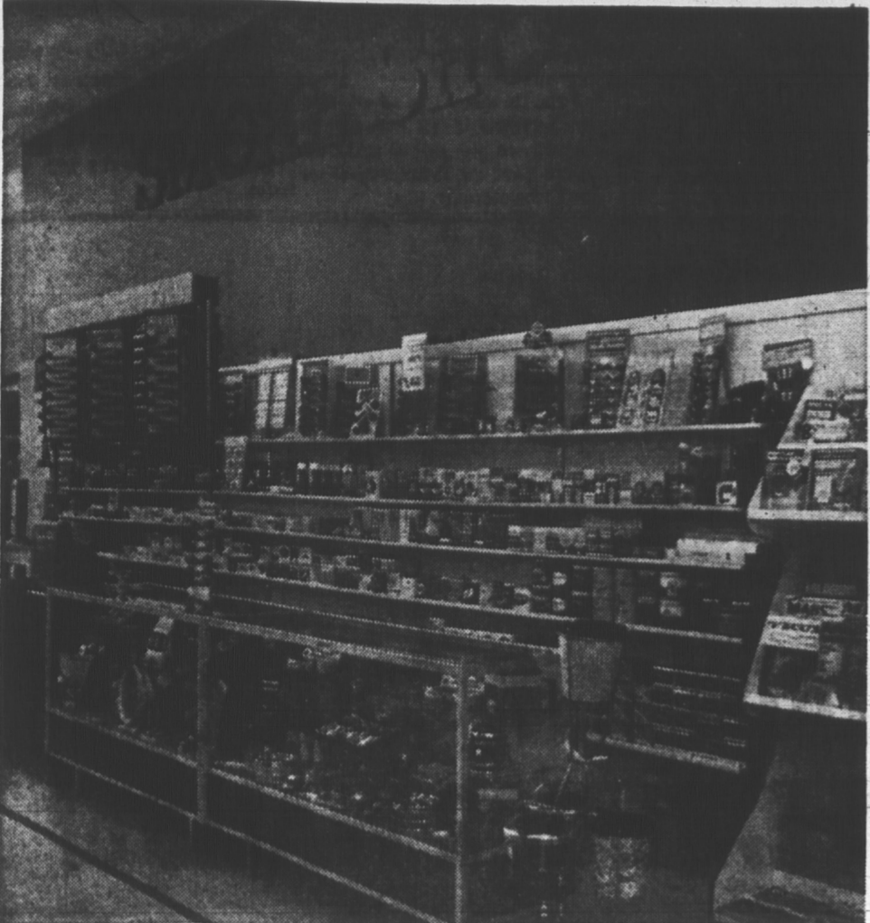
VARIETY OF SMOKERS SUPPLIES

Over 20 departments offering the shopping public everything from ladies wear to goldfish and television sets is what is to be found when Stedman's at the Royalty Mall Shopping Plaza open their doors to the public on Wednesday.