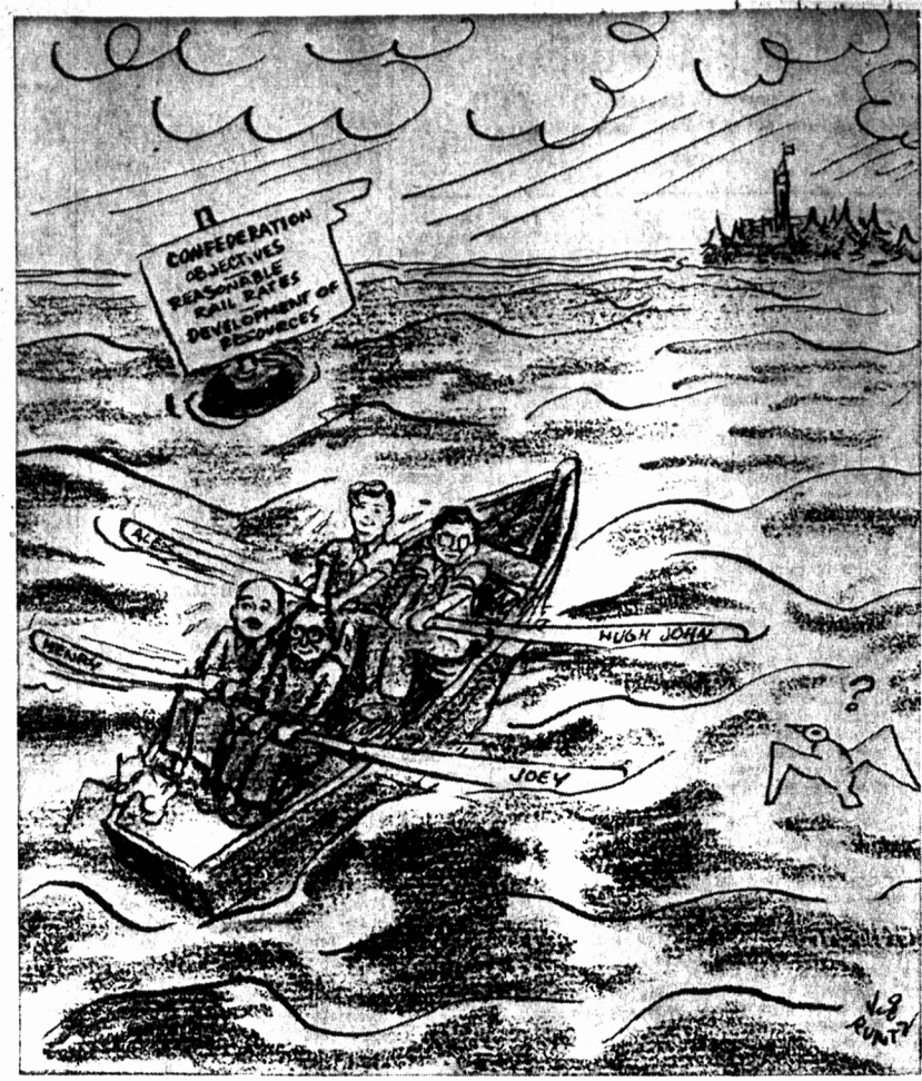
YO - HEAVE - HO!

The broadcast concluded by asserting: "activities of the Church must be exposed in a merciless way". A joint committee of the United States Senate and the House of Representatives has approved a bill for the control of narcotics. Among its provisions is one that permits juries to recommend the death penalty for anyone convicted of selling heroin to juveniles. Another makes possession of heroin a felony, a judiciary sub-committee having reported that heroin serves no medical purpose that cannot be performed by less dangerous drugs. Supplies now legally held would be sold to the Treasury Department. Still another provision permits jail terms up to 40 years, with no possibility of parole, for selling any narcotic illegally. No doubt, the Canadian Parliamentary Committee now studying the same problem will take a good look at these recommendations.