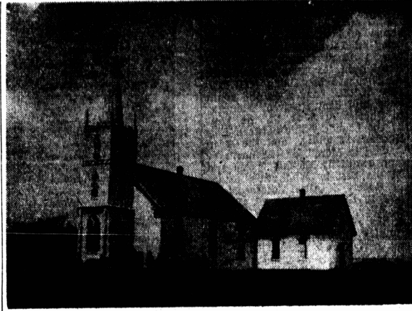
Old St. James Church, Summerside. Begun in 1865, completed 1870.