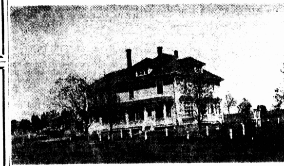
St. James Rectory. Begun 1918, completed 1919.