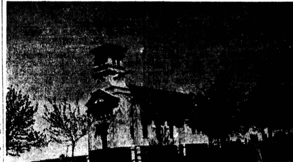
St. James Church, Summerside. Begun in 1928, completed 1929.