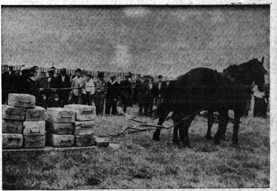
WEIGHT PULLING CONTEST The weight pulling contest is always a chief attraction at an exhibition. This powerful pair of draft horses demonstrate their strength for onlookers at the Egmont Bay-Mount Carmel Exhibition Wednesday.

But the commission isn't finished with hearing from the farmer and the consumer. First to appear at Toronto will be the Co-operative Union of Ontario, the Ontario branch of the Canadian Association of Consumers and the Ontario Farmers' Union. Result of the commission's probe could affect either or both the producer and the consumer. Chief aim of its report to the government will be to establish the responsibility for the price spreads—the difference between what the producer gets for his food products and what the consumer pays the corner grocer or supermarket. Final hearings will be held in Quebec City, Oct. 14, Montreal Oct. 15-18, and Ottawa Nov. 14-19.