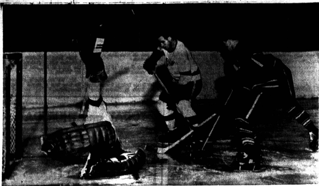
Armstrong Scores Lone Goal

The camera catches goalie Glen Armstrong in unusual position as he misses puck scored by George Armstrong. Leafs strong scored only Toronto goal from right of Toronto Maple Leafs during National Hockey League game in Toronto. Leafs strong scored only Toronto goal from right of Toronto Maple Leafs during National Hockey League game in Toronto. Leafs strong scored only Toronto goal from right of Toronto Maple Leafs during National Hockey League game in Toronto.