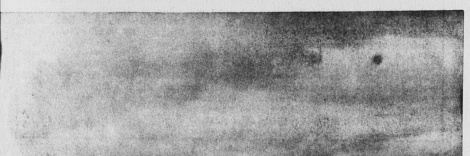
REGIONAL HIGH SCHOOL IS LARGEST IN PROVINCE