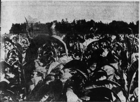
MONTAGGUE IS FOCAL POINT OF ISLAND'S TOBACCO INDUSTRY