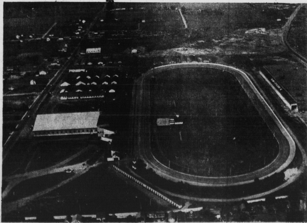
IN 1963 "OUR GRANDSTAND GOT A NEW TOP"