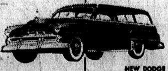
NEW DODGE SAVOY