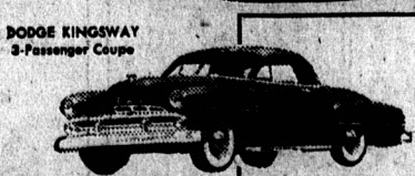
DODGE KINGSWAY 3-Passenger Coupe